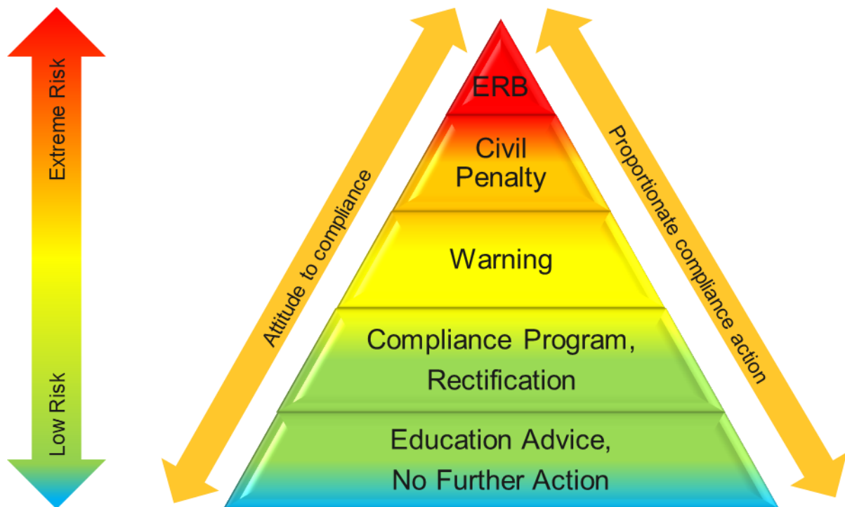
Figure 3: Compliance Actions

5.3.3 Figure 3 shows the compliance actions available to the ERA and how the ERA may apply them based on assessed risk. This information should be read in conjunction with step 5.2.138(c)(iii) above. Each matter investigated must be considered on a case-by-case basis having regard to the individual circumstances applicable to that matter.